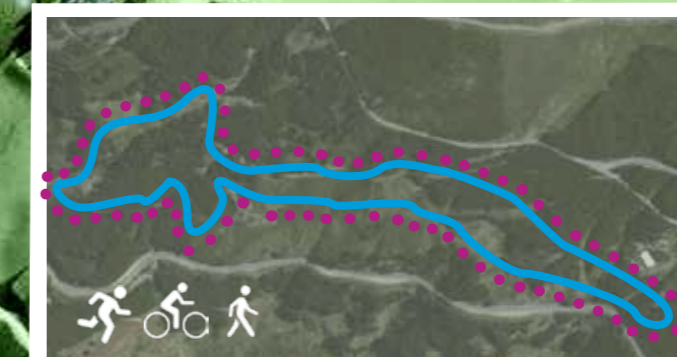
CIRCUIT / ROUTE Fuente Alta TOTAL LEHTH 8660m VERTICAL DROP 125m