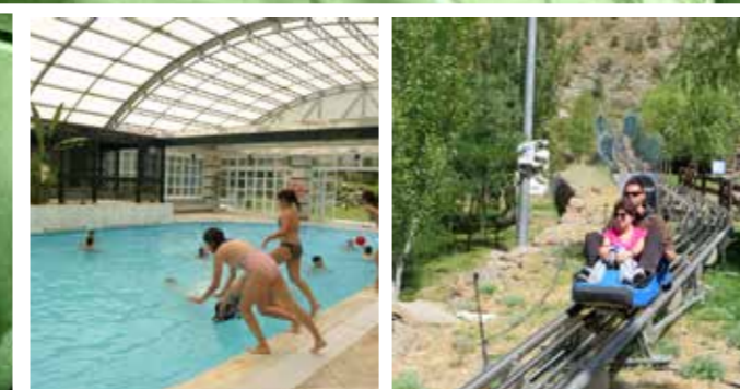
Club Montebajo swimming pool Mirlo Blanco amusement area

+ Info and inscriptions: sierranevadabikepark.com